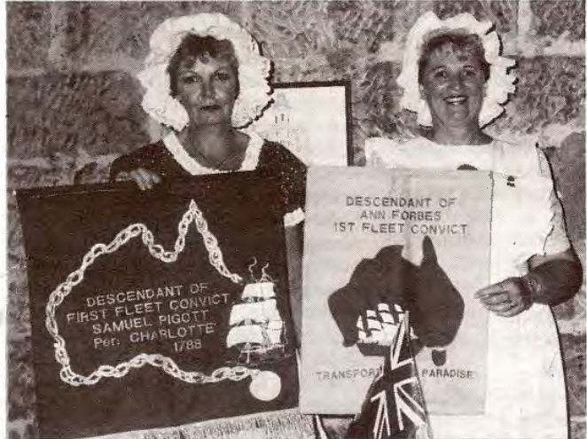
Two First Fleeters celebrating Australia Day

the most successful undertakings in the establishment of a nation from a virtually untouched virgin land.