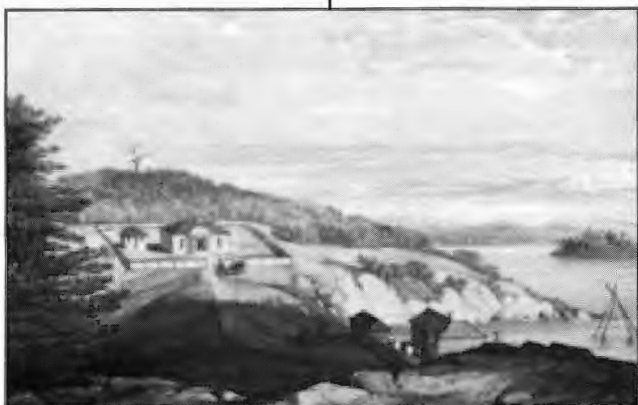
Customs House, Twofold Bay