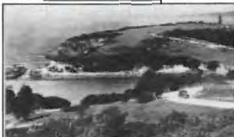
The road climb from the wharf