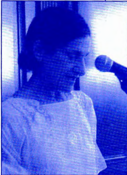
Her Excellency Professor Marie Bashir AV CVO Governor of NSW