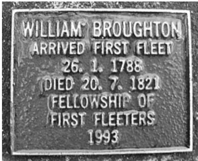
Typical example of a brass plaque

An important activity of the Fellowship is the location and identification of First Fleeter graves. A bronze plaque is attached to the tombstone (where possible) and an unveiling ceremony held.