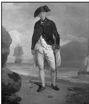
Captain Arthur Phillip

A fleet of 11 ships was assembled to carry approximately 1500 government officials, convicts, seamen, marines, and their wives and children to create a new British Colony on the other side of the world. Captain Arthur Phillip was chosen by Lord Sydney to lead this venture.